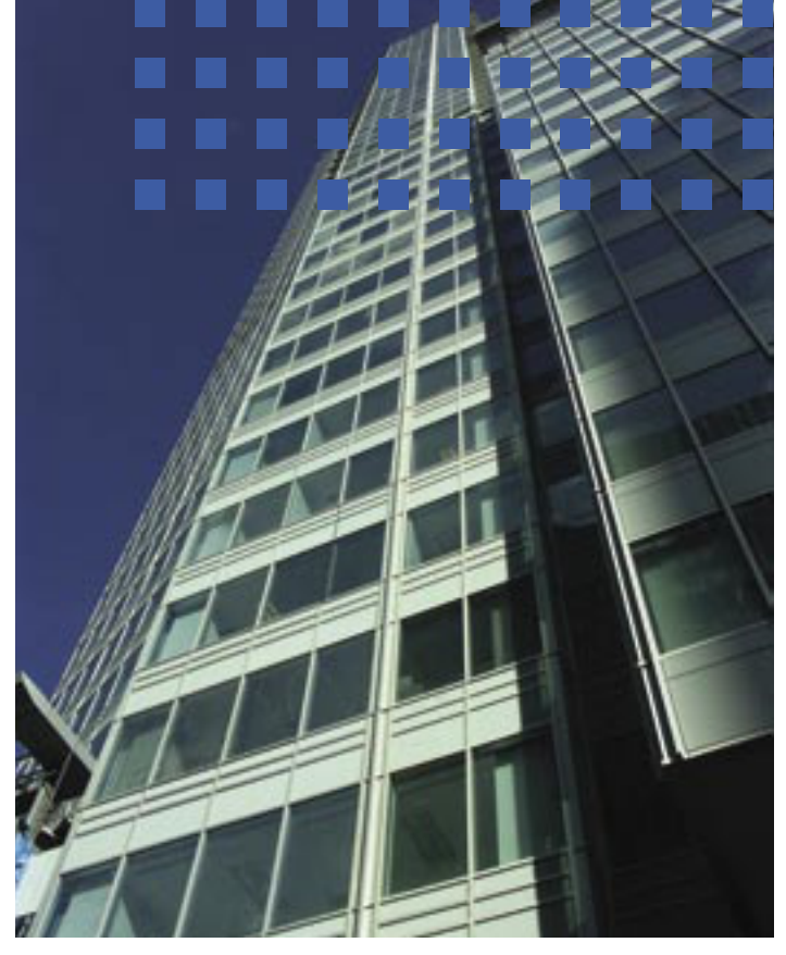
Shaw Tower, Vancouver, British Columbia, Canada. James KM Cheng Architects, Inc. #RC3-1199 Silver Lining OPACI-COAT-300® on AFG Clear Glass. Fabricator, Vitrum Industries.