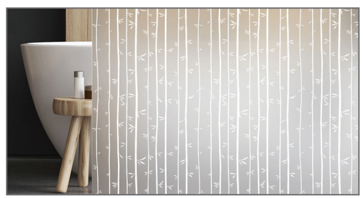
HPG_ORG_018 Printed on Acid Etched Glass