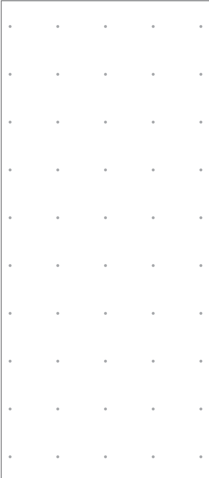
Pattern - HPG_BF_009