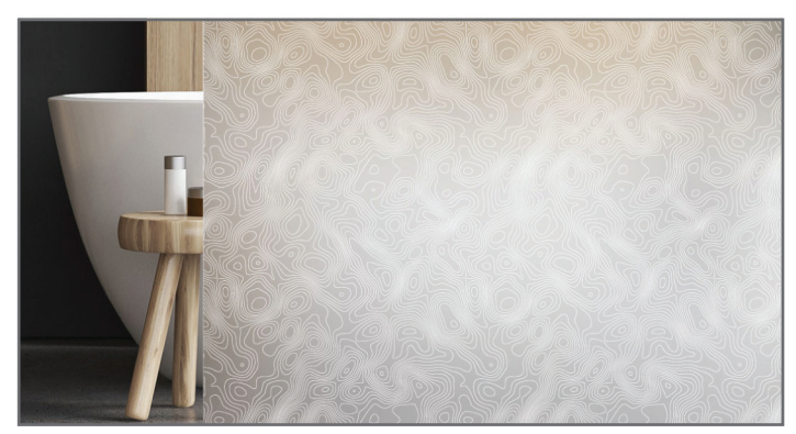
HPG_ORG_001 Printed on Acid Etched Glass