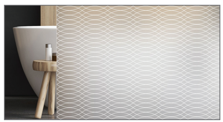
HPG_BCF_017 Printed on Acid Etched Glass