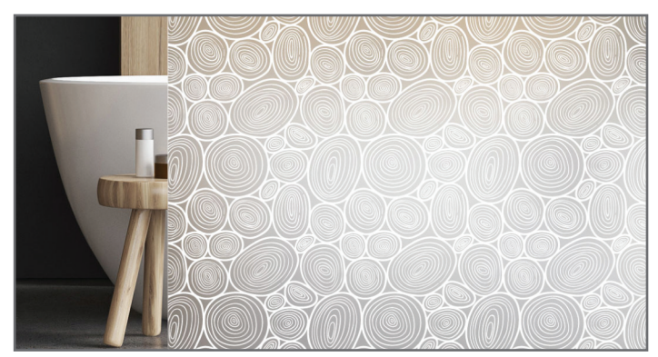
HPG_ORG_003 Printed on Acid Etched Glass