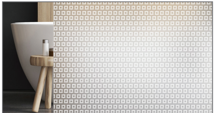
HPG_BCF_003 Printed on Acid Etched Glass