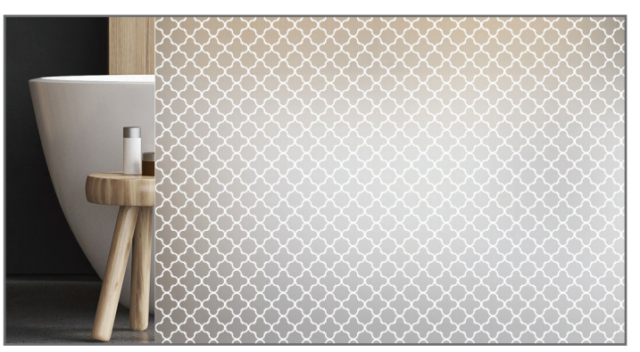
HPG_FUS_002 Printed on Acid Etched Glass