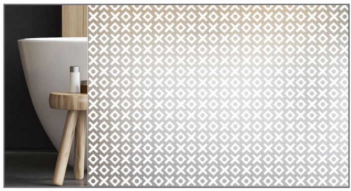
HPG_FUS_005 Printed on Acid Etched Glass