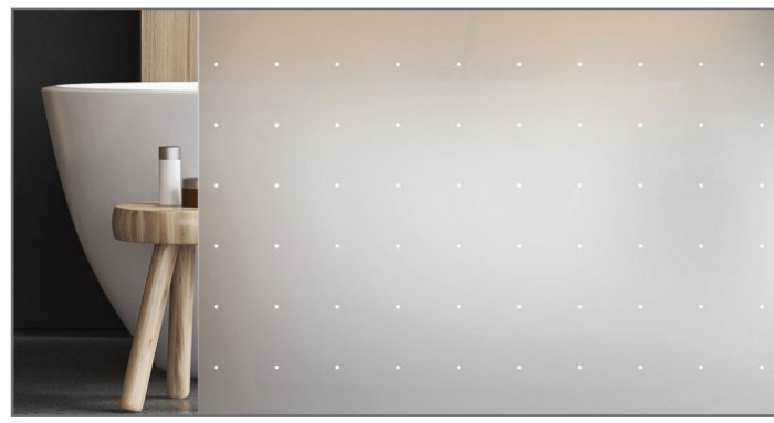
HPG_BF_007 Printed on Acid Etched Glass