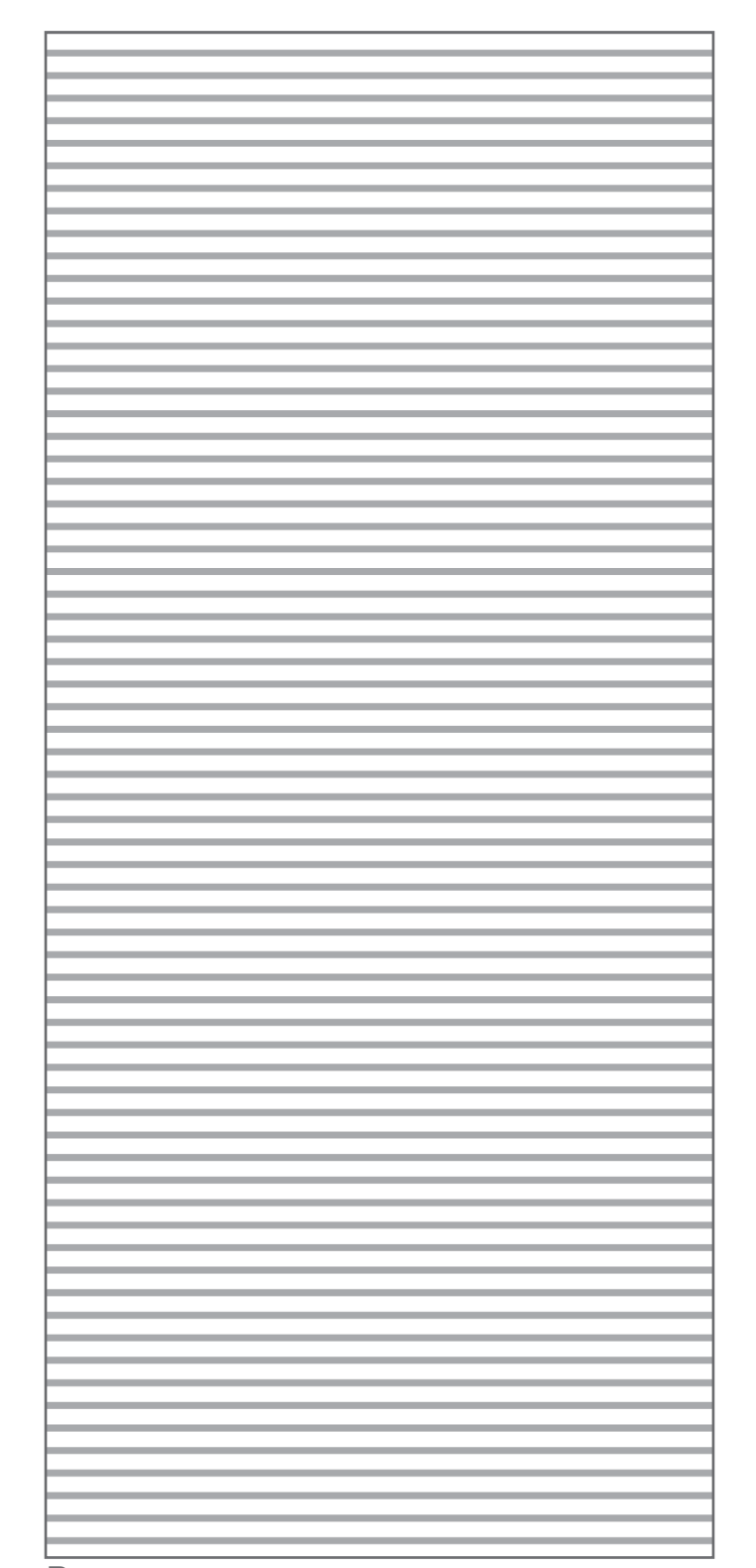
Pattern - HPG_3LP30