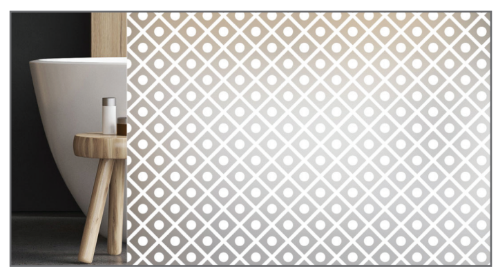
HPG_GEO_012 Printed on Acid Etched Glass