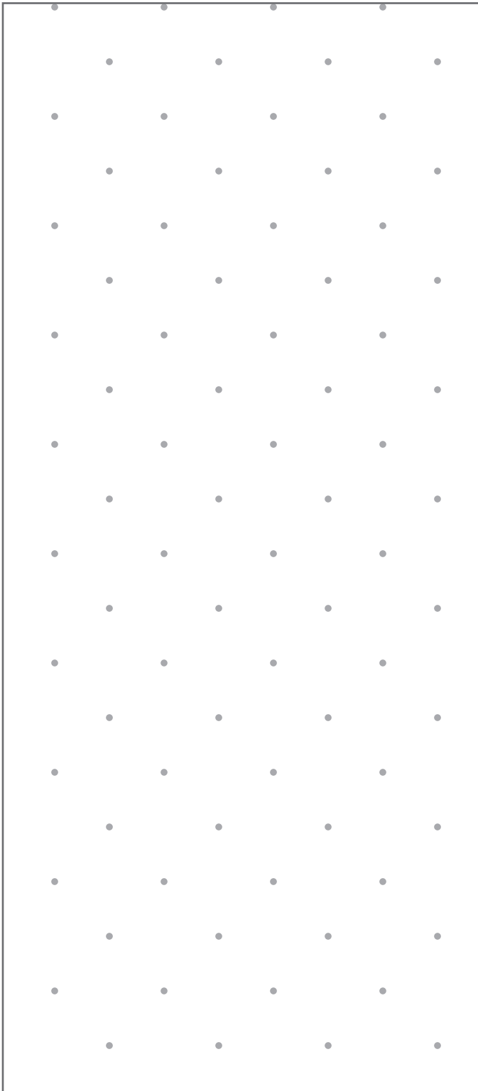
Pattern - HPG_BF_001