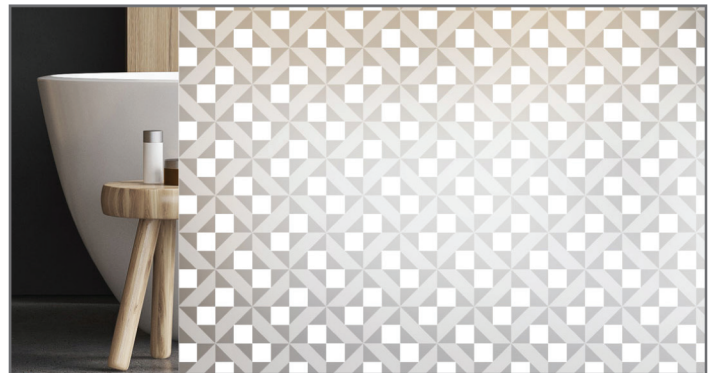
HPG_ORI_019 Printed on Acid Etched Glass