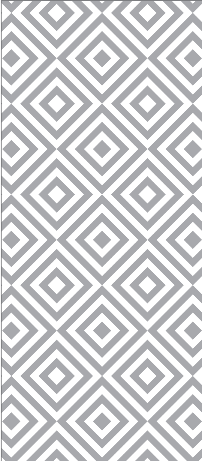
Pattern - HPG_GEO_011