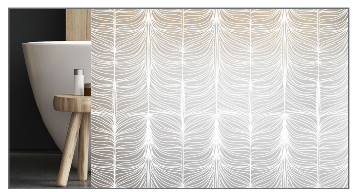
HPG_ABS_016 Printed on Acid Etched Glass