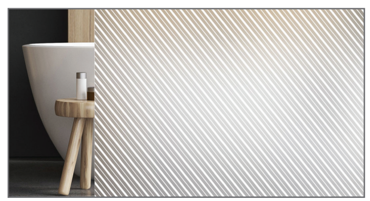
HPG_FUS_011 Printed on Acid Etched Glass