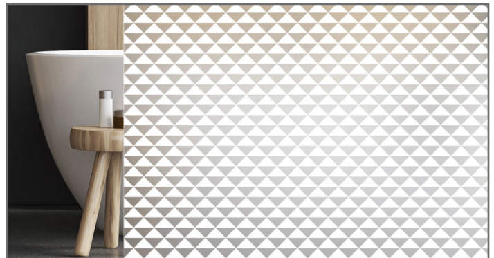
HPG_GEO_008 Printed on Acid Etched Glass