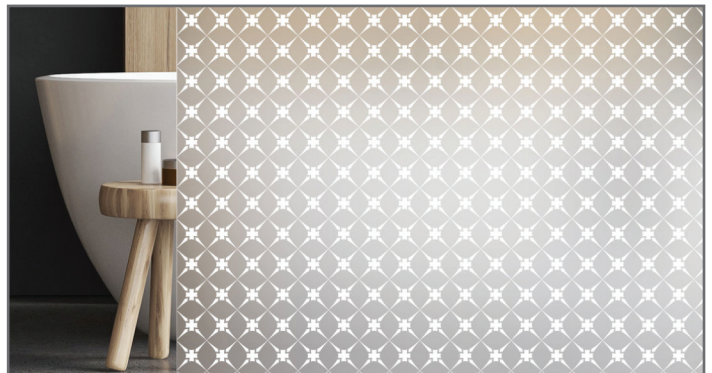
HPG_ORI_016 Printed on Acid Etched Glass