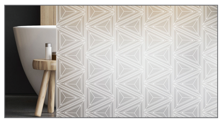
HPG_GEO_019 Printed on Acid Etched Glass