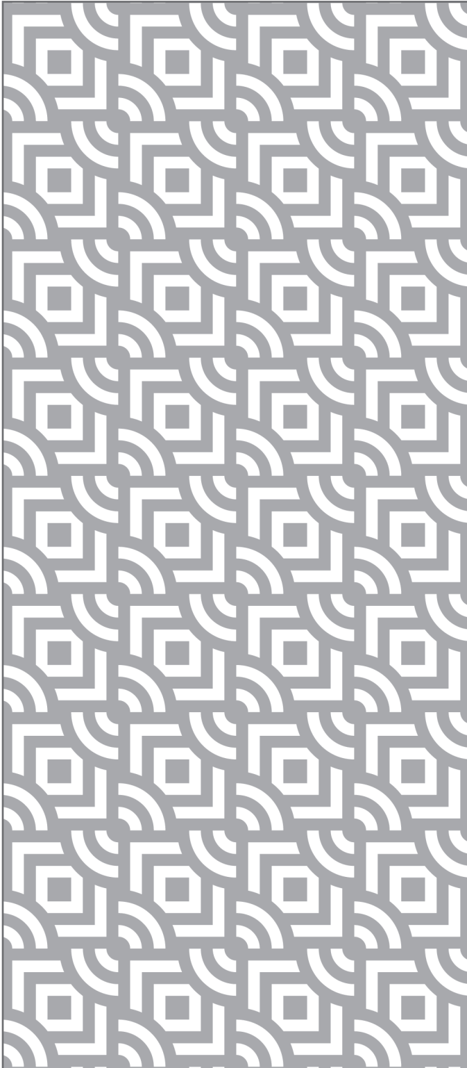
Pattern - HPG_ABS_004