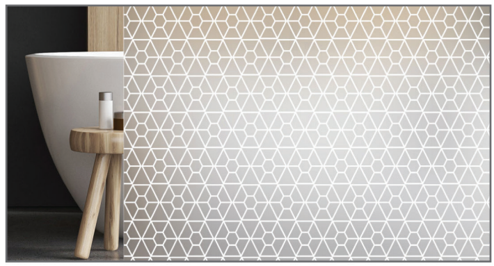
HPG_ORI_020 Printed on Acid Etched Glass