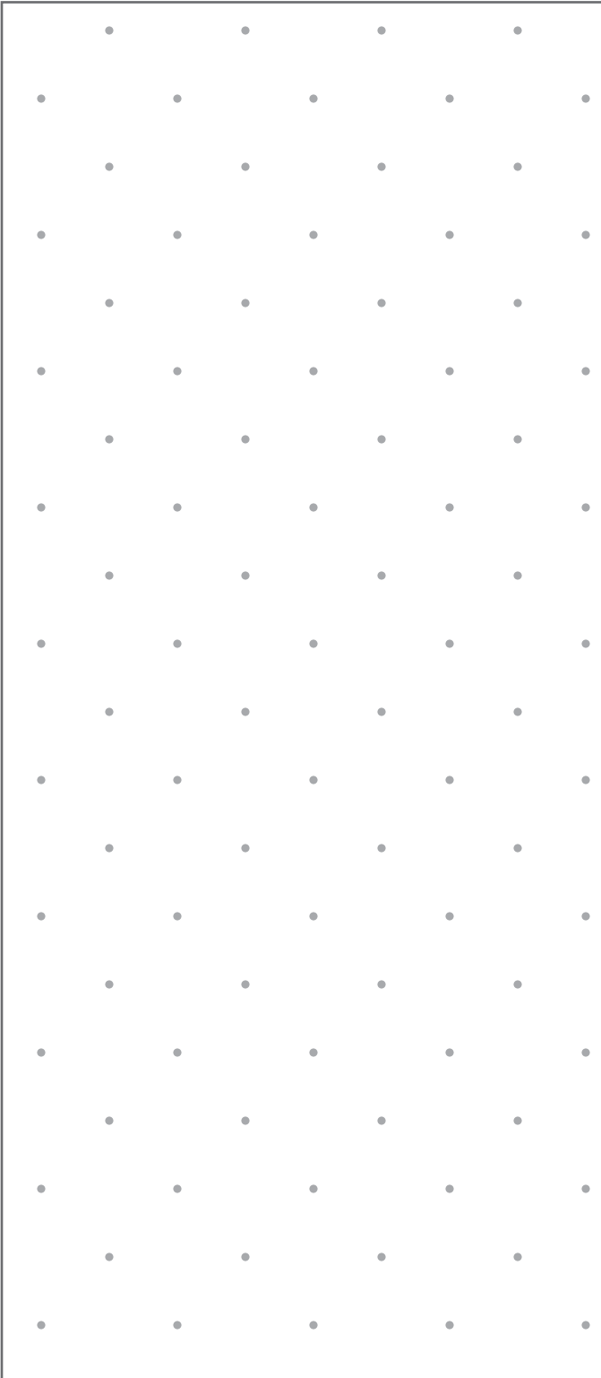
Pattern - HPG_BF_001