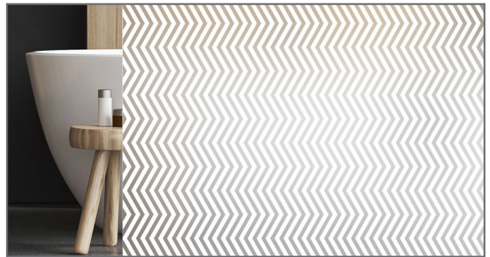
HPG_GEO_005 Printed on Acid Etched Glass