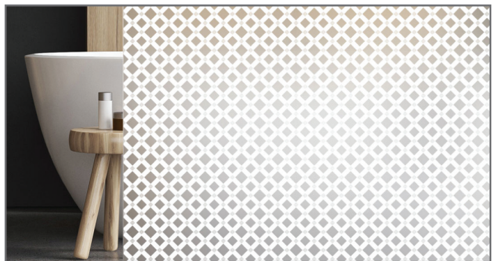
HPG_BCF_022 Printed on Acid Etched Glass