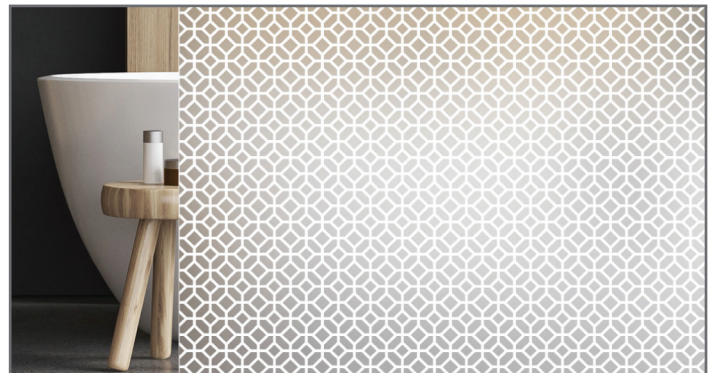
HPG_ORI_006 Printed on Acid Etched Glass