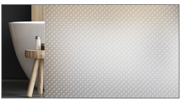
HPG_BCF_025 Printed on Acid Etched Glass