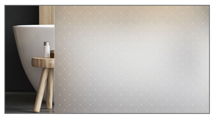
HPG_BCF_030 Printed on Acid Etched Glass