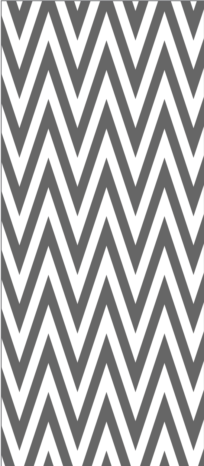
Pattern - HPG_GEO_014