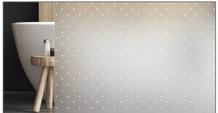
HPG_BF_004 Printed on Acid Etched Glass