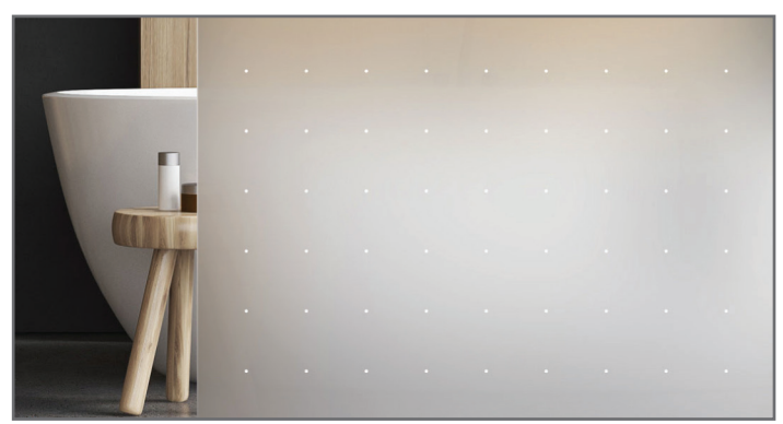
HPG_BF_003 Printed on Acid Etched Glass