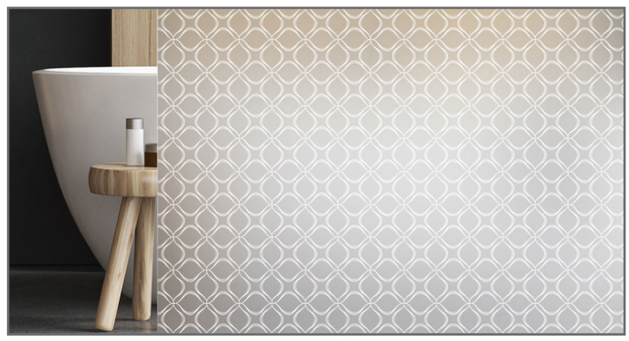
HPG_ABS_006 Printed on Acid Etched Glass