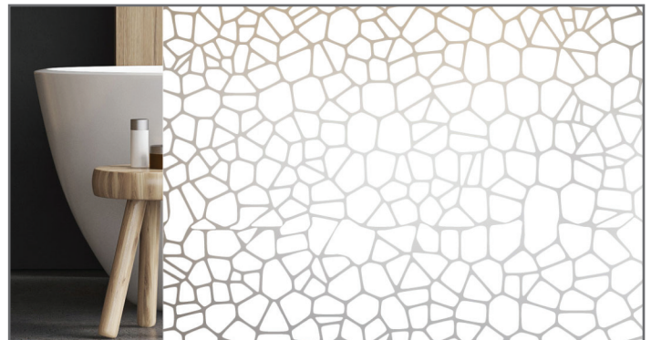
HPG_ABS_014 Printed on Acid Etched Glass