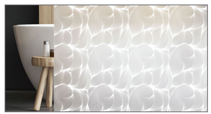
HPG_ABS_012 Printed on Acid Etched Glass