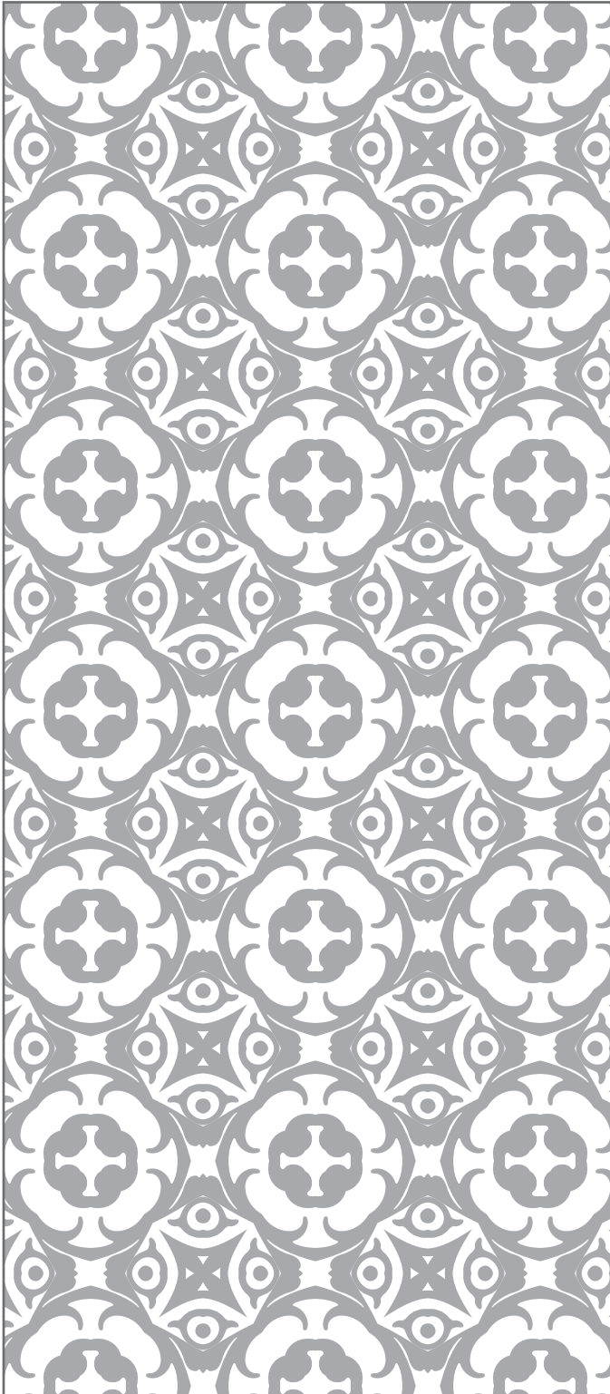
Pattern - HPG_FUS_006