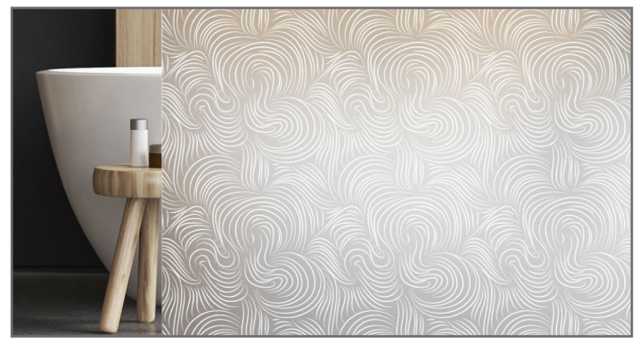
HPG_ABS_011 Printed on Acid Etched Glass