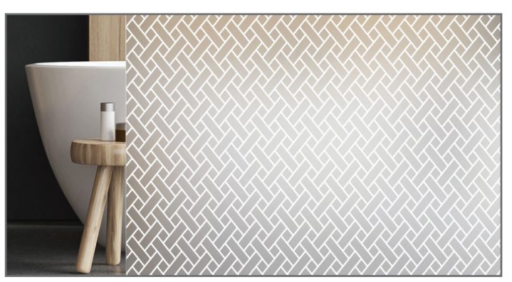
HPG_FUS_016 Printed on Acid Etched Glass