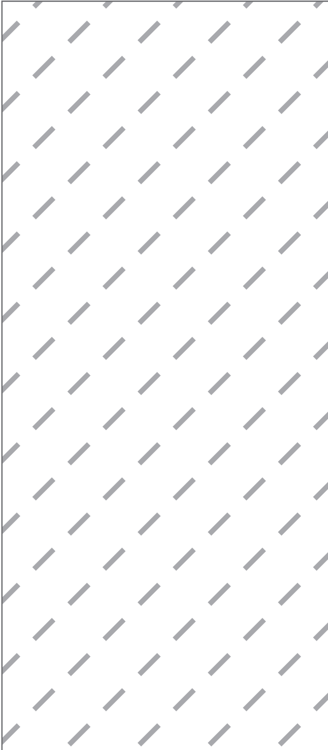
Pattern - HPG_BCF_025