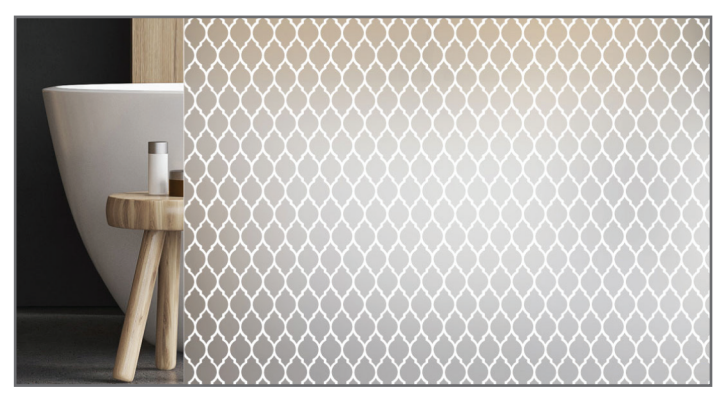
HPG_FUS_001 Printed on Acid Etched Glass