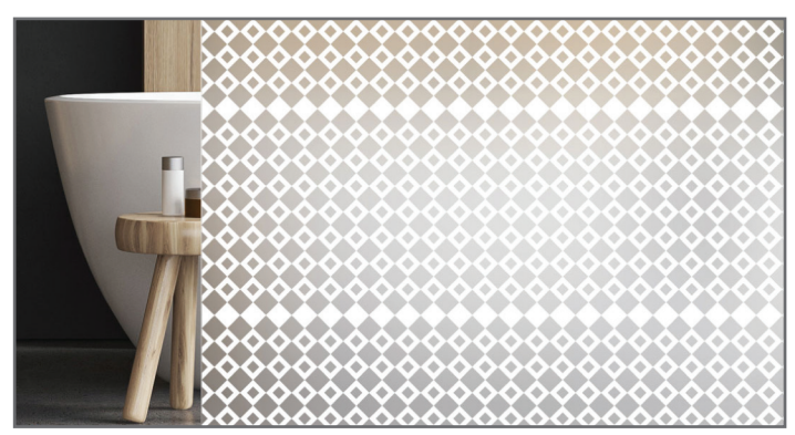
HPG_GEO_015 Printed on Acid Etched Glass