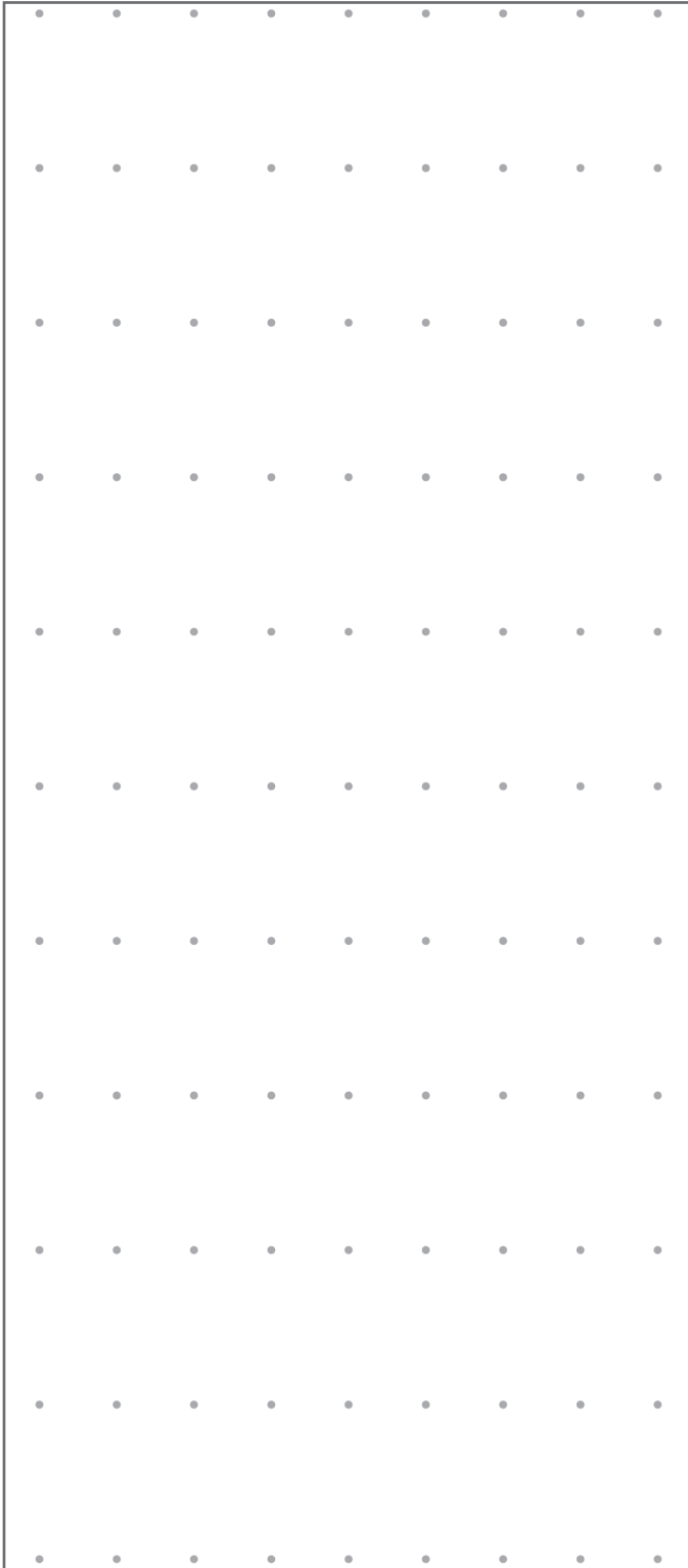
Pattern - HPG_BF_006