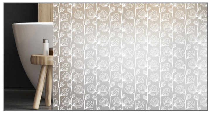
HPG_ORG_010 Printed on Acid Etched Glass