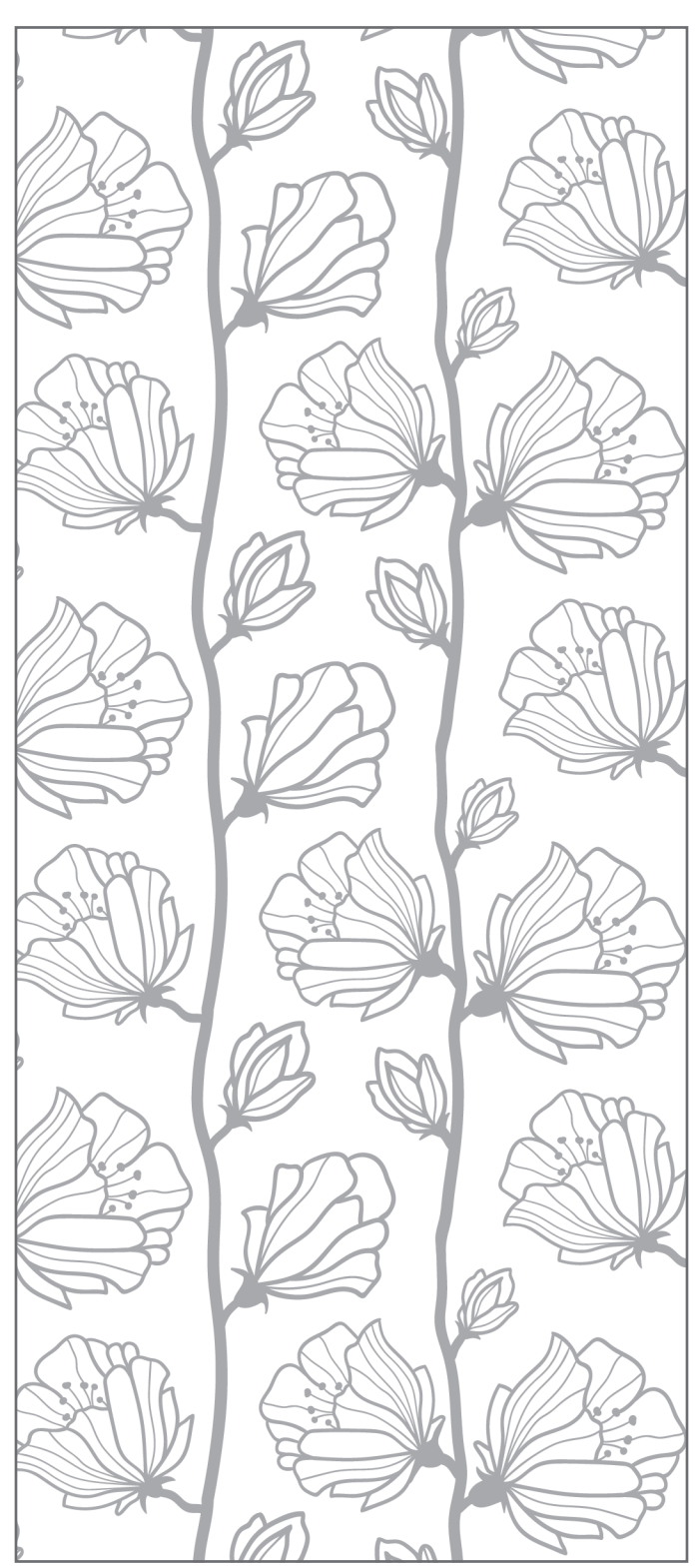
Pattern - HPG_ORG_010