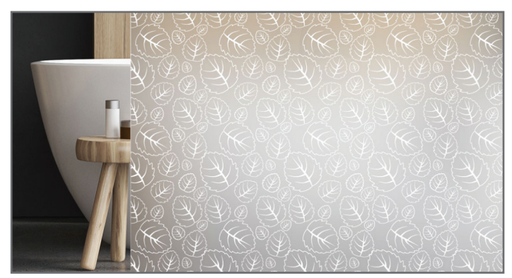
HPG_ORG_009 Printed on Acid Etched Glass