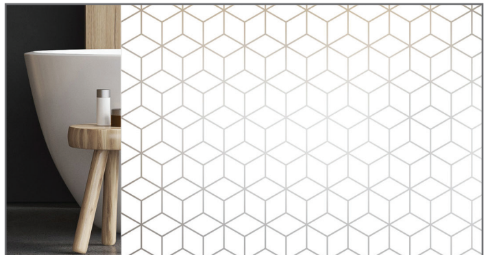
HPG_GEO_007 Printed on Acid Etched Glass