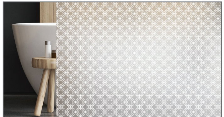
HPG_ORI_011 Printed on Acid Etched Glass