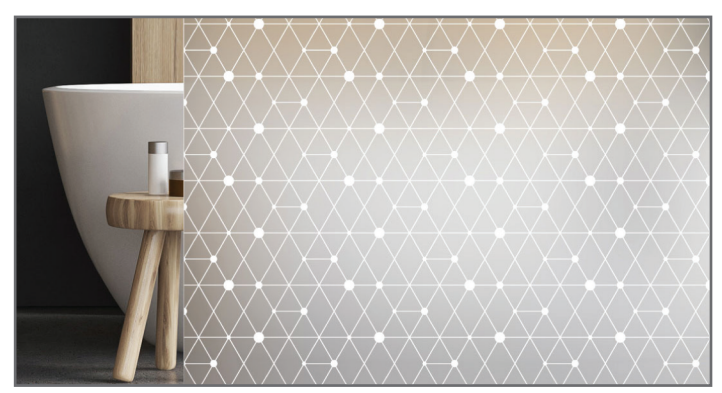
HPG_ABS_005 Printed on Acid Etched Glass